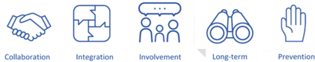
Figure 1: The 5 ways of working from the Well-being of Future Generations Act

Just as when we were preparing the Well-being Assessment, we have used the five ways of working, collaboration, integration, involvement, long-term, and prevention, to guide our work. This means that while considering how to improve well-being in our communities now, we've also looked at how well-being could be affected in the future and how we can prevent issues becoming worse. We will need to work together to see what we're each doing in a community and how this affects what we do, individually and in partnership. Finally, but most importantly, we want our communities, professionals, businesses, and others to identify the issues which are most important to them. As we develop how we will be delivering the Objectives and Steps (regional and local delivery plans) we will continue to use these principles to guide our work.